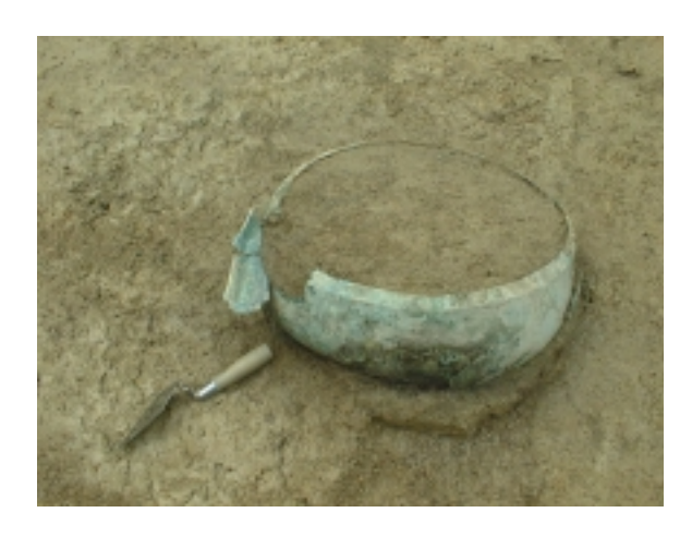
Bronze cauldron recovered at Tumulus 17