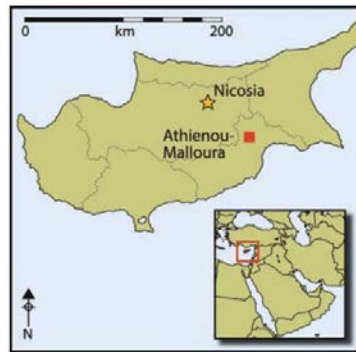
Figure 1: Map of Cyprus with Malloura

Through the years, as archaeologists have borrowed and developed new technologies to record and interpret the material record, we have increased our knowledge of the past and developed new research questions. The Athienou Archaeological Project (AAP), which has undertaken excavation and pedestrian survey in the Malloura Valley (Cyprus) for the last 25 years (Fig. 1), has exploited an array of innovative techniques for documenting Malloura's extensive archaeological record. Most recently, AAP has utilized new imaging technologies to document the ancient past at Malloura at multiple scales from landscapes (drones), to features (photogrammetry), to artifacts (3D scanning).