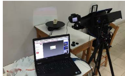
Figure 2: Structured Light Scanner

HDI R1X structured light scanner from GoMeasure3D ( http://gomeasure3d.com/ ). The system includes a central projector, two 12mm cameras that gather the data on surface geometry, and a digital SLR camera that captures the photo texture of the artifact, as well as a software program (Flexscan3D) that provides a seamless connection with the scanner (Fig. 2).