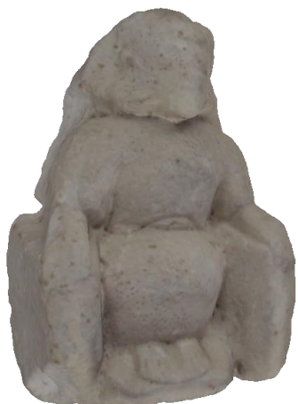
Figure 4: Limestone Statuette

To respond to the current conditions 'on the ground' in 3D publishing in archaeology, in spring 2017 we will publish a digital, open-access interactive catalogue of a select corpus of Malloura sculptures. Just as traditional catalogues utilize photographs or drawings to accompany the formal description and analysis, the "Malloura eCatalogue" (name still under consideration) will include an embedded viewing interface, allowing user-driven interaction with each 3D artifact model. The digital catalogue will be published by bepress ( http://www.bepress.com/ ), a leader in Open Access scholarly publishing services, and available/archived through UWM's hosted institutional repository, Digital Commons, where it will be accessed anywhere in the world via an online interface or downloadable as a dynamic, 3D-enabled PDF. In addition to traditional forms of peer review, we plan to engage with a pre-publication focus group that will include a variety of specialists to develop a user-friendly interface that makes the most of the technology and format. Post-publication user-input will also come in the form of a feedback section, which can then be used to maintain a living document with time-stamped updates or additions to research.