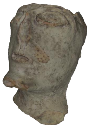
Figure 5: Terracotta Sculpture Fragment

By integrating the digital 3D artifact models within the traditional artifact catalogue, we believe we are adding a more dynamic type of representation that allows analysis not otherwise possible with only 2D illustration. For example, 3D models can be (1) digitally measured, (2) viewed with different lighting or surface conditions to accentuate variations in surface details like tool marks or fingerprints that might otherwise be invisible to a camera and (3) manipulated with 100% access through rotation and zoom at any scale, providing unlimited remote investigation at much more depth than a photograph. Additionally, broken pieces of sculpture can be scanned as single pieces and digitally joined. Thus, while 3D digital artifact models are still very much akin to traditional representations such as photographs or drawings, certain features enhance the analytical and interpretive potential of a normal artifact catalogue, especially when combined with standard contextual information and discussion.