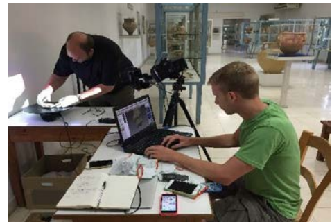
Figure 3: Working in the Larnaca Museum (Cyprus)

This scanner can generate 1.1 million data points per scan, with a normal accuracy range of 65 to 125 microns (.065 to .12 mm!); an individual scan is captured in about 1 second. One specific benefit is the ability to change the field of view, allowing us to capture a wide range of artifact sizes – from roughly 5cm to 65cm. Working for a month in the midst of display cases in the prehistoric galleries of Larnaca District Archaeological museum (Fig. 3), we were able to scan roughly 90 Malloura sculpture fragments (Figs. 4-5).