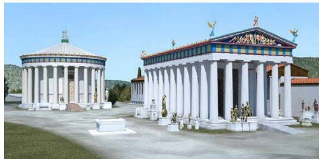
The Thymele

Sunday, September 25 th 2016 Sabin Hall, Room G90, 3:00 p.m.