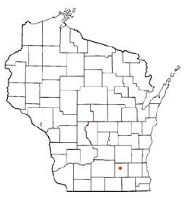
Map of Wisconsin, Aztalan indicated

The Aztalan site in Jefferson County, Wisconsin is a mound and village complex that was occupied by a mixed population of Late Woodland and Mississippian Indians from about A.D. 900 to 1300. The site first captured the public imagination in 1837 when it was described as a mysterious "city in the wilderness". Although certainly not a "city" as currently defined, one hundred and seventy-six years of archaeological investigations at the site have yet to fully dispel many of the mysteries surrounding Aztalan' s presence in southern Wisconsin. However, recent investigations by UWM archaeologists have shed new light on previously under reported aspects of site structure, settlement chronology, subsistence practices, external relations, and community ethnogenesis.