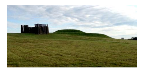
Southwest Mound at Aztalan

Sunday, December 7, 2014 Sabin Hall Room G90, 3:00 p.m.