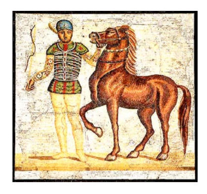
Roman charioteer, mosaic, 3rd century A.D. (Palazzo Massimo alle Terme, Rome)