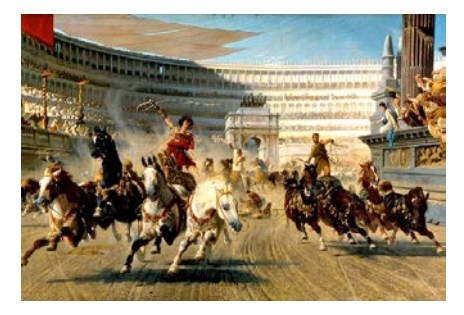
Wild ride: The Chariot Race, c. 1882 by Alexander von Wagner

Many misperceptions surround the spectacles held in ancient Rome, especially as a result of contemporary film and television. For instance, there is the popular belief that gladiatorial combats were the premiere spectacle at Rome: that they attracted the biggest audiences and the most partisan fans. In fact, neither assumption is true. The Circus Maximus in Rome - the original and largest venue for chariot-racing - was many centuries older and considerably larger than the Colosseum. In addition, chariot-races drew the largest crowds and most fervent fans in Rome and throughout the Roman Empire, and continued to do so centuries after the gladiatorial games faded away. This lecture will explore the circus games' activity and setting, their star performers, their spectators and fans, and the central importance of the circus games for Roman society as a whole.