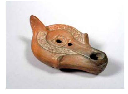
Roman oil lamp (N13538), Photo: Dawn Scher Thomae

Old World archaeology collections focus on European Paleolithic sites, with special emphasis on the French Paleolithic and Paleolithic through Neolithic materials from Hungary. Of note are the lake-dweller materials from Switzerland, mostly from the Robenhausen site. Old World Classical archaeological material –Greek, Etruscan, Roman, Cypriot and Maltese – is housed in the Anthropology Department, the Middle Eastern archaeological material, including Ancient Egypt, Classical coins, Islamic ceramics and a vast collection from the Tell Hadidi excavations in Syria, is curated by the History Department.