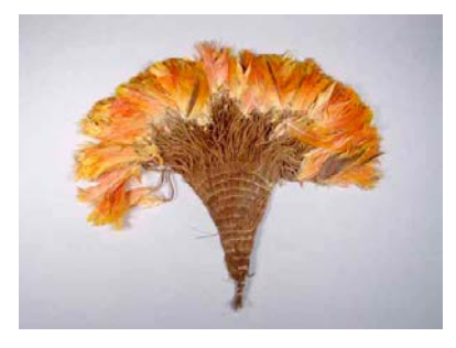
Peruvian Fan (A52245)

numbering more than 7000 items, gold from Peru, Panama, Costa Rica and Colombia, and a wide variety of artifacts in shell, stone and wood. Ceramics include a significant collection of vessels from Casas Grandes in northern Mexico, a strong collection from South America, particularly Chimu and Nazca, and excavated material from Atitlan and Bilbao, Guatemala. Maya materials include Jaina figurines and significant items from West Mexico. MPM also holds a small collection of archaeological material from the Caribbean, particularly Grenada.