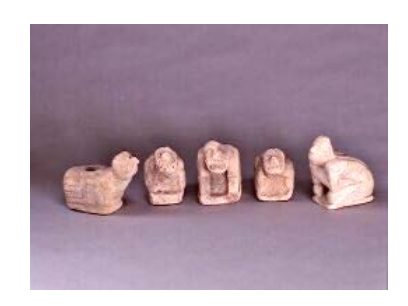
Effigy pipes from Emerald Mound, Mississippi (A16205)

By Dawn Scher Thomae Curator of the Anthropology Collections, Milwaukee Public Museum