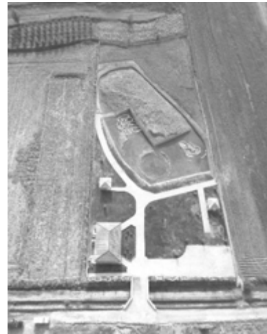
Aerial View of Burial Mound of Kamenica, Southeast Albania, 13 th - 6 th centuries B.C.E