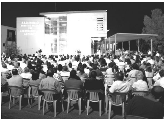
Opening Night Ceremonies, Athienou Municipal Museum (July 3, 2009)