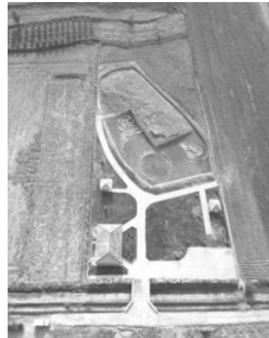
Aerial View of Burial Mound of Kamenica, Southeast Albania, 13 th - 6 th centuries B.C.E