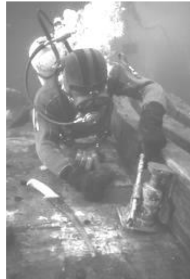
Hydraulic jack and saw being used to dismantle frame timbers from the San Juan wreck