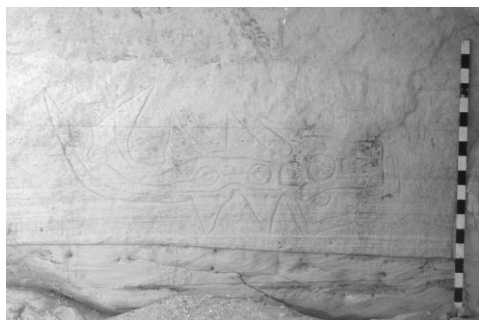
Mythical Whale Petroglyph, Nasca Valley, Peru

The Grande River System in Peru's Department of Ica is best known for the large scale drawings on the desert floor collectively known as "The Nasca Lines." The name "Nasca Lines" is a broad generalization, however, often used to describe a wide variety of geoglyphs in various styles. In fact, geoglyphs of different types can be found not only in the Nasca Valley and the adjacent pampas (elevated plateaus), but also in the northernmost valleys of the river system. In recent years, the area's geoglyphs have been studied alongside smaller scale examples of rock art, i.e. petroglyphs. That research has taken place primarily in the Palpa Valley, where petroglyph sites are well-known.