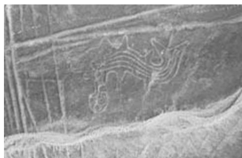
Mythical Whale Geoglyph, Nasca Valley, Peru

As part of her doctoral research, Nieves conducted a rock art survey of the Nasca Valley and was able to document 26 petroglyph sites in this valley alone. Nasca Valley petroglyphs were clearly comparable to Paracas