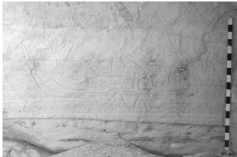
Mythical Whale Petroglyph, Nasca Valley, Peru

The Grande River System in Peru’s Department of Ica is best known for the large scale drawings on the desert floor collectively known as “The Nasca Lines.” The name “Nasca Lines” is a broad generalization, however, often used to describe a wide variety of geoglyphs in various styles. In fact, geoglyphs of different types can be found not only in the Nasca Valley and the adjacent pampas (elevated plateaus), but also in the northernmost valleys of the river system. In recent years, the area’s geoglyphs have been studied alongside smaller scale examples of rock art, i.e. petroglyphs. That research has taken place primarily in the Palpa Valley, where petroglyph sites are well-known.