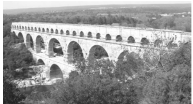
Pont du Gard, Aqueduct Bridge, 1 st Century B.C.