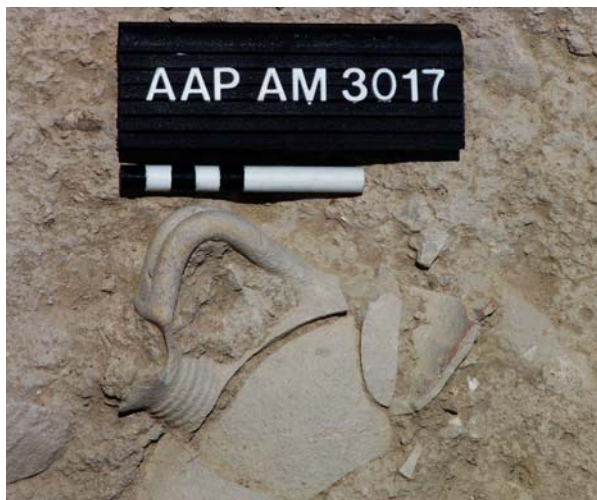
In-situ vessel

What are the pros and cons surrounding the acquisition by museums of antiquities, particularly those without context or provenance? What is the connection among the looting of archaeological sites, the antiquities market and the presence of unprovenanced antiquities in many museum collections? What effect will the repatriation to Italy and Greece of antiquities from the collections of noted museums such as the John Paul Getty Museum in Malibu, the Metropolitan Museum of Art in New York and the Museum of Fine Arts, Boston have on their ability to build their collections and educate the public? What is the legality of repatriation claims by countries of origin such as Italy, Greece, Egypt, Peru and others under their own and U.S. laws? These and other controversies have been much in the news lately, often depicting archaeologists and museum professionals in deep disagreement with each other. But is there any common ground between them?