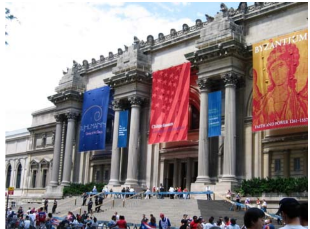
The Metropolitan Museum of Art, New York City