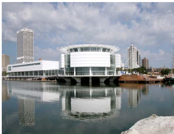
Discovery World at Pier Wisconsin

If you have not yet had the opportunity to visit our city’s newest public education venue in downtown Milwaukee you ought to. Discovery World at Pier Wisconsin certainly does not fit the mold of the typical science and technology museum of the 20th Century; indeed, being designated a museum at all makes some staff members uneasy. Whether you call it a learning center, an edifice of edutainment, a museum, or none of the above, the fact remains that stasis is not in Discovery World’s vocabulary. The overarching mission is to “connect innovation, science and technology with exploration, environment and water resources through experimental learning programs.” The role of archaeology education in this broader mission was only recently envisioned and has since become an integral part of program development.