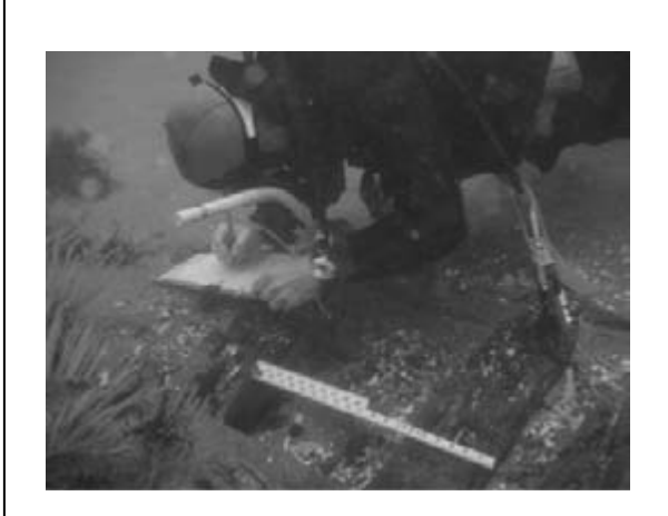
Artifact Illustration in the Ocean.

easily accessible for the archaeologist. Furthermore, being neutrally buoyant means you are able to attain a variety of vantage points when working over a given object/site. I imagine it is comparable to working in outer space...equipment floats around you and everything is quiet except for the sound of your exhalations.