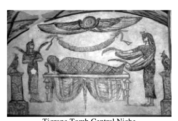
Tigrane Tomb Central Niche