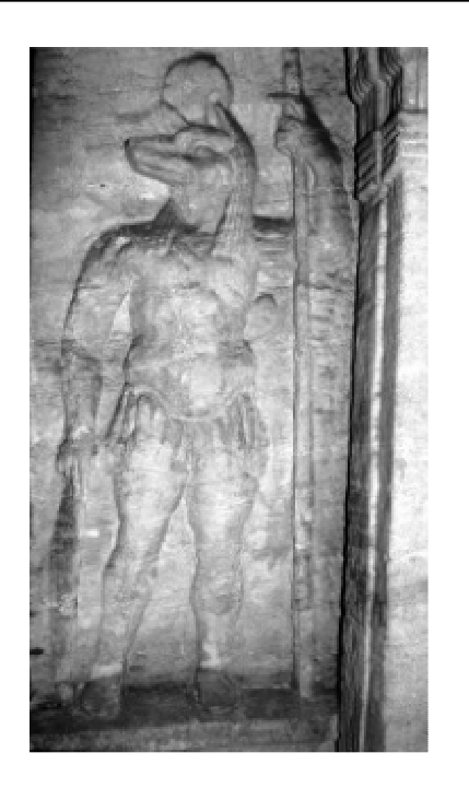
Anubis, Kom el-Schoqafa

consider the social, religious, economic, and political context and implications of the monuments. Her articles have appeared in the American Journal of Archaeology , Hesperia , Antike Kunst , and the Journal of the American Research Center in Egypt and in other periodicals, festschrifts, and collections of scholarly papers.