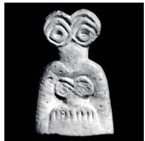
Alabaster 'Eye Idol' from Tell Brak, north-eastern Syria, c. 3500-3300 BC