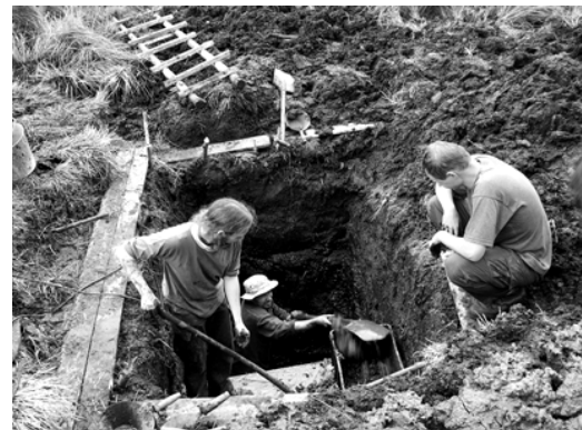
German and Czech archaeobotanists conducting a wet-site excavation in Bohemia.

Inspiration provided by: Flannery, Kent, 1982. The Golden Marshalltown: A Parable for the Archeology of the 1980s. American Anthropologist , (84):2, 265-278.